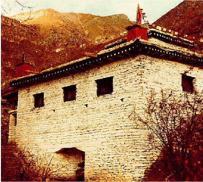
The “Temple Of Miraculous Fire” at Muktinath, Nepal.